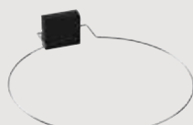
Sauna heater's safety device, SFE-D350 SFE-D450 SFE-D530