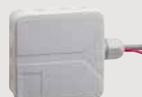
Mobile remote start system FS-SY