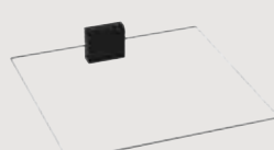
Sauna heater's safety device, SFE-350400 SFE-500500