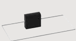
Sauna heater's safety device, SFE-220400