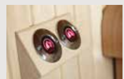
Autodose sauna water dispenser SASL1